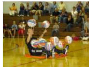
Champions Forever performance