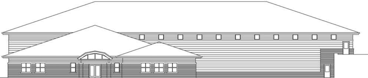
DAYCARE/SCHOOL ENTRANCE - LOWER LEVEL